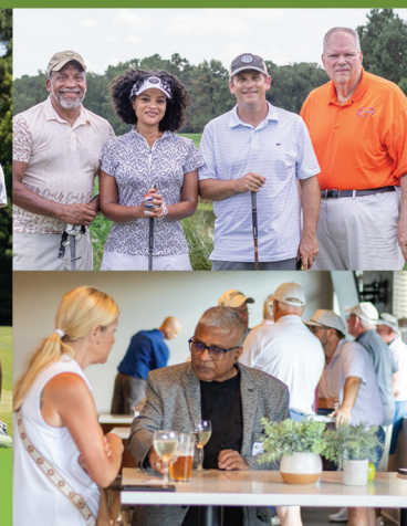
2025 Percepture Savannah Golf Outing Committee in Conjunction with Specialty & Agro Chemicals America